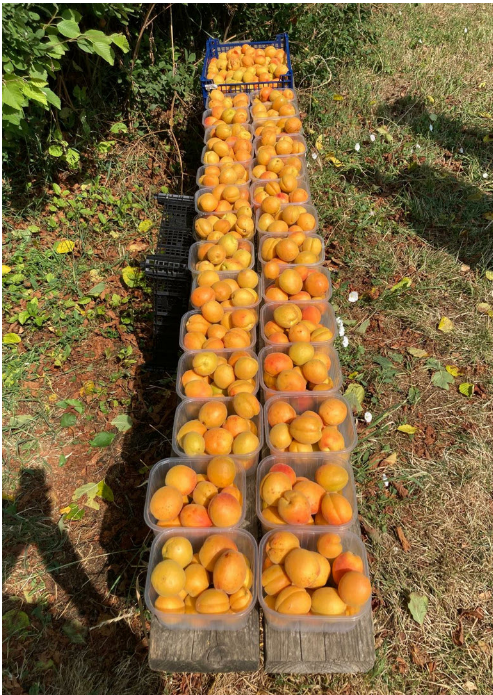
Picked at the WOT2grow Community Orchard.